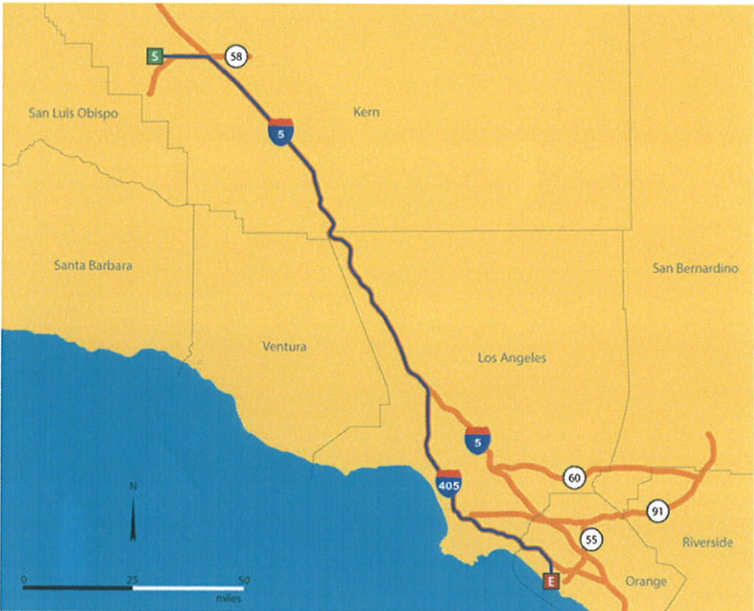
Overview Map from Buttonwillow to Ascon