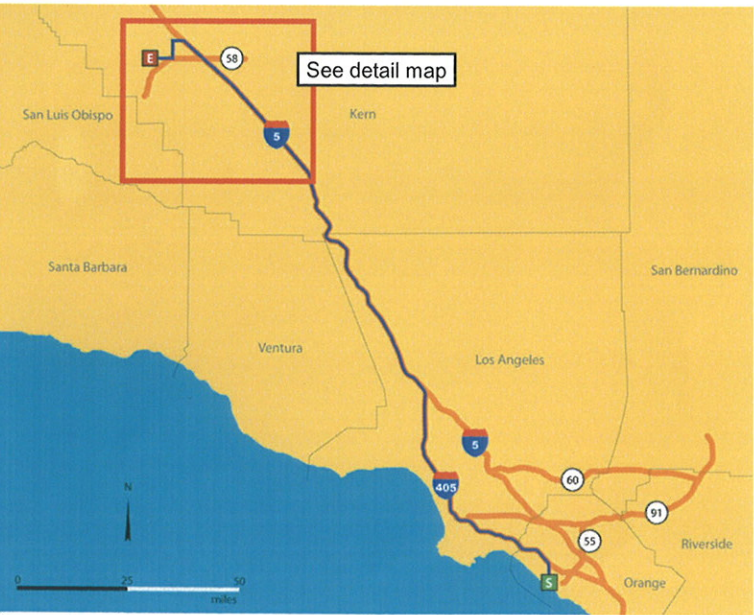
Overview Map from Ascon to Buttonwillow